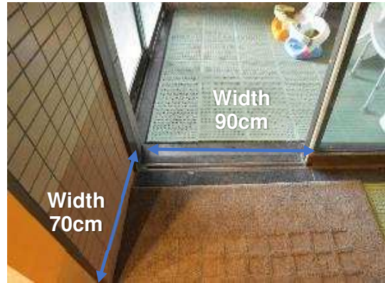
Entrance from the changing room to the bathroom