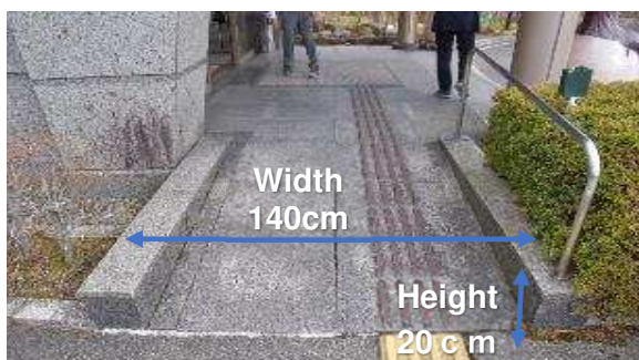
Slope to the entrance

Communal areas got rid of unevenness as much as possible to enable wheelchair users to safely access guestrooms.