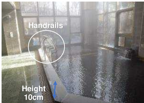
Communal Bathhouse: There are steps inside the bathtub