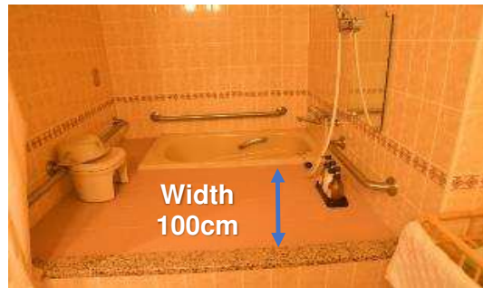
Bath & Toilet