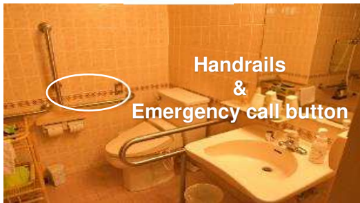
Bath & Toilet